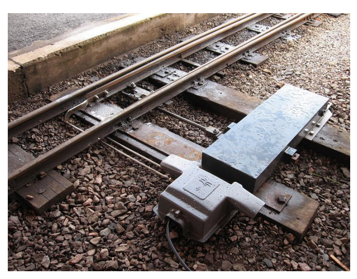
Standard BR998 detector fitted to PM15 machine.

The point and lock machine has integral electrical detection of the locks. A separate switch rail detector can be added by using a common alignment plate. The BR998 detector is ideal for this purpose, but other designs can be used.